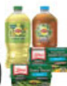
Libby's Vegetable Cups 4 count or Lipton Tea 64 oz.