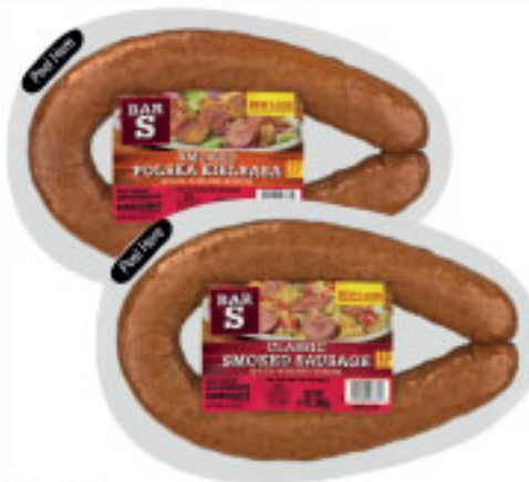
Bar-S Polska Kielbasa or Smoked Loop Sausages 13 oz.