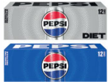
Pepsi 12 pack