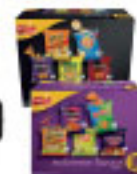
Frito-Lay Variety Pack 18 count