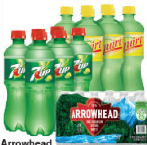
Arrowhead Spring Water 24 pack, 16.9 oz. or Squirt or 7-Up 6 pack, 16.9 oz.