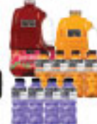
Langers Apple Juice, Cranberry 3 liter or Powerade 8 pack, 20 oz.