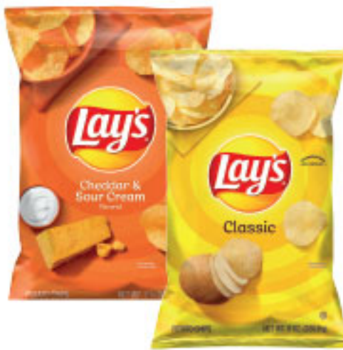
Lay's Potato Chips 7.75-8 oz.