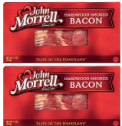
John Morrell Bacon 12 oz.