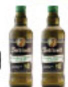
Botticelli Extra Virgin Olive Oil 25.3 oz.