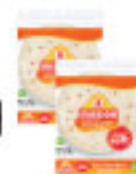
Mission Soft Taco Tortillas 10 count