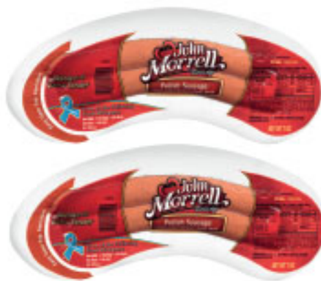
John Morrell Smoked Sausage 7 oz.