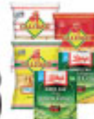
Calidad Tortilla Chips 10.5-11 oz. or Libby's Corn or Green Beans 28-29 oz., Jumbo