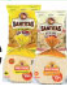
Mission Corn Tortillas 30 count or Santitas 11 oz.