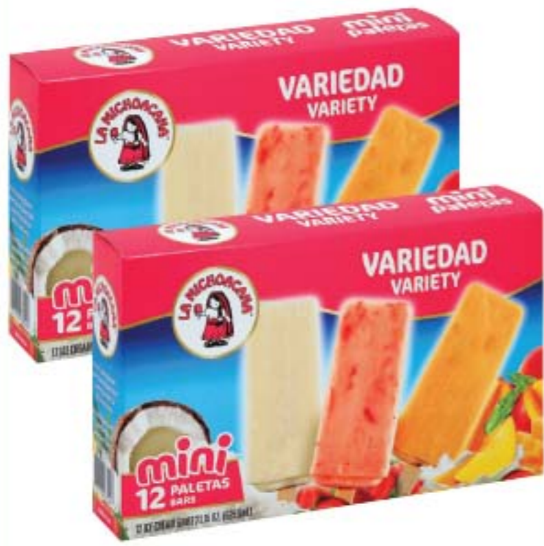
La Michoacana Mini Ice Cream Bars 12 ct.