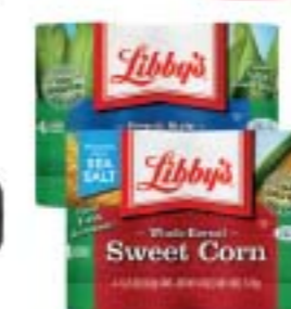
Libby's Vegetable 4 pack cans