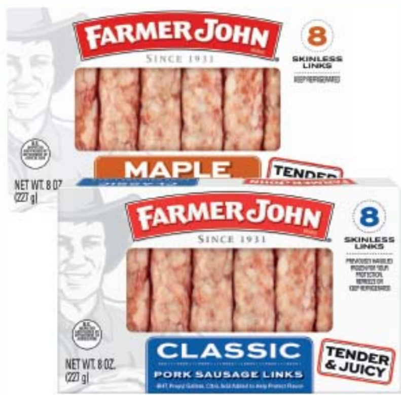
Farmer John Skinless Links 8 oz.