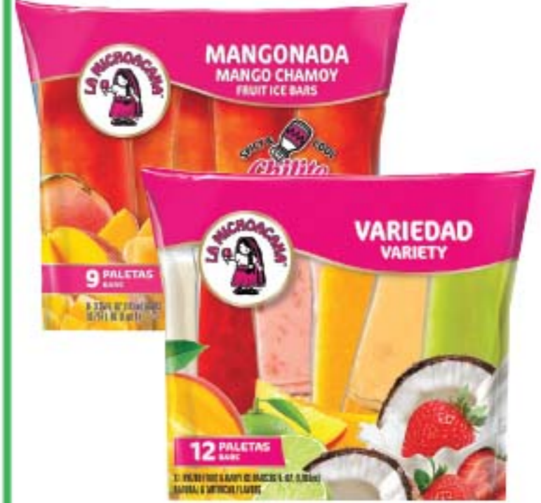
La Michoacana Fruit Ice Bars 12 ct. or Mangonada 9 ct.