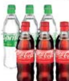
Coca-Cola 6 pack, .5 liter bottles