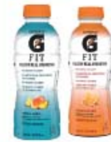
Gatorade Fit 16.9 oz.