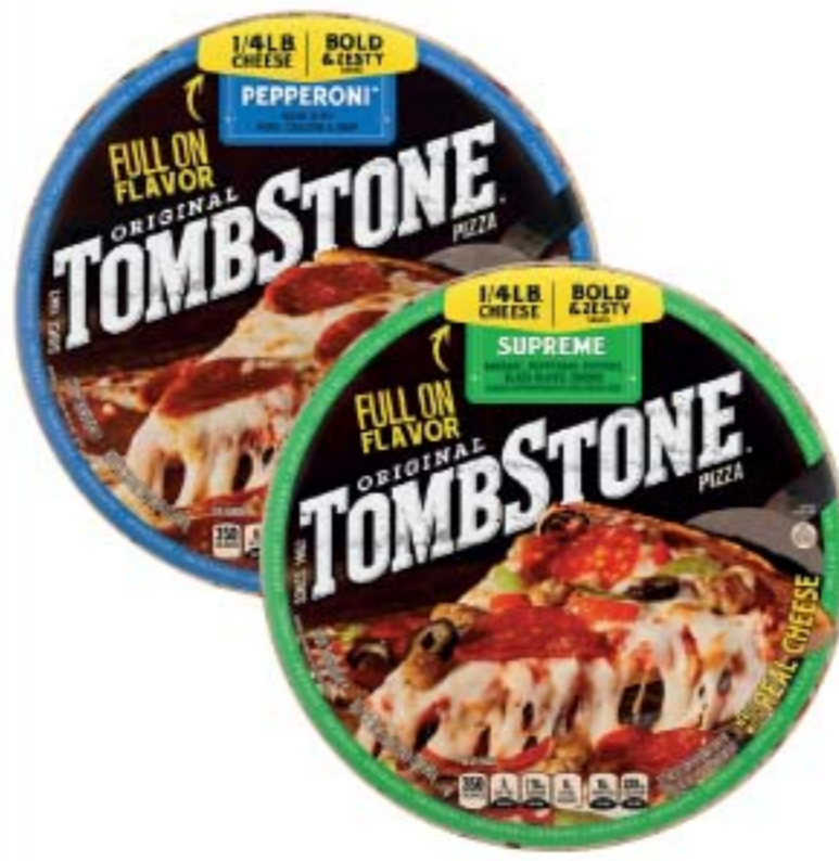
Tombstone Pizzas 12 inch