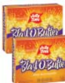
Jolly Time Blast O Butter Popcorn 6 pack