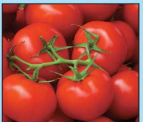
Hothouse Tomatoes On the Vine