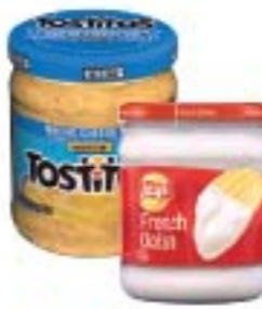
Lay's or Tostitos Dips 10-15.75 oz.