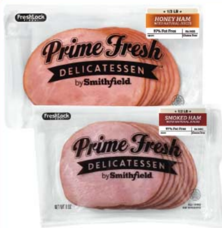
Prime Fresh Deli Meats 7-8 oz.