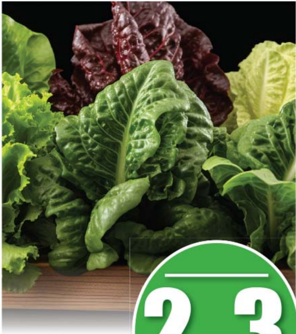
Romaine, Red or Green Leaf Lettuce