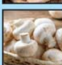
Monterey Whole White Mushrooms 8 oz.