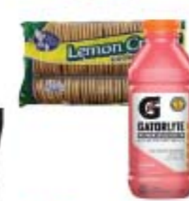
Lil' Dutch Maid Crème Cookies 25 oz. or Gatorlyte 20 oz.