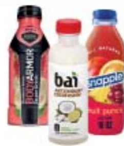
Snapple or Bai 16-18 oz. or Body Armor 16 oz.