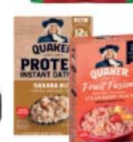
Quaker Protein or Fruit Fusion Instant Oatmeal 8 count