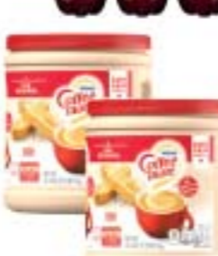
Coffeemate Powder 35.3 oz.