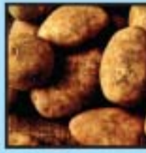
Premium Russet Potatoes