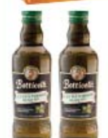
Botticelli Extra Virgin Olive Oil 16.9 oz.