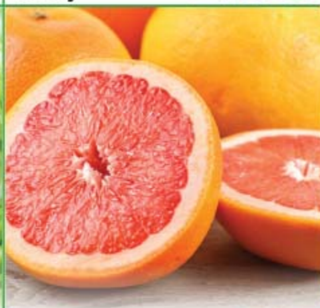
Pink Grapefruit 5 lb. bag